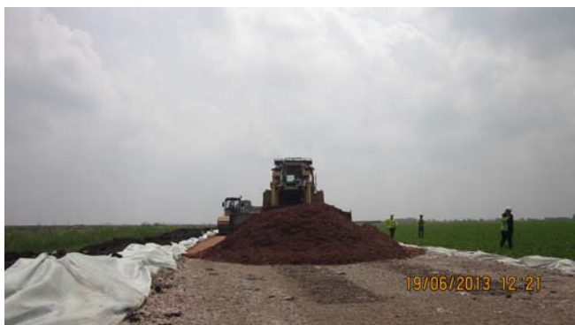
Access track under construction at Goosetree, A605.

The majority of the work will take place in the summer and early autumn to avoid disturbing overwintering birds on the Nene Washes.